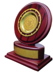
SIES SOP Star Awards 2021